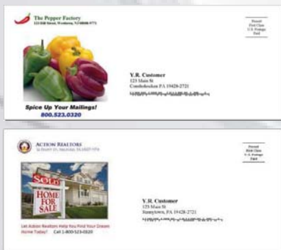
Model SL 600