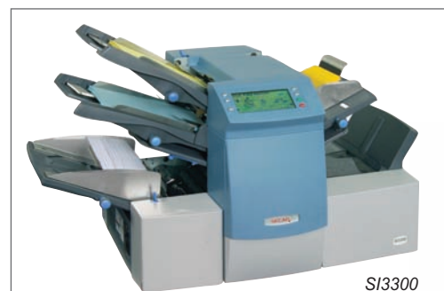
The SI3300 and SI3500 process routine office, promotional and transactional mail. The SI3300 operates at speeds up to 3,000 pieces per hour. It offers a standard envelope feeder holding up to 100 envelopes. The SI3500 processes up to 3,500 pieces per hour and has a robust envelope feeder which holds up to 325 envelopes.

Maximize the value of each mail piece with accuracy and control By using Optical Mark Recognition (OMR), you can control the contents of each mail piece. You gain a new level of flexibility to customize each mail piece as well as control contents with a high degree of confidence.