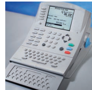
The control center offers ease of use and access to services.