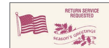
Add messages to your mail with a choice of downloadable envelope ads.

Neatly stacks mail for optimum productivity. Full sensor on stacker eliminates overflow.