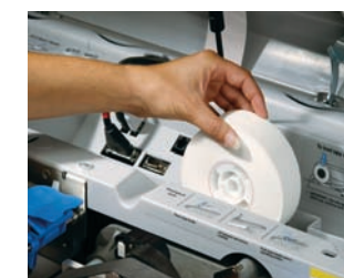
With the drop in roll tape system, your tape usage will be efficient as each tape is cut to exact size.