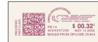
Prints USPS® compliant indicia. Add your choice of downloadable postal inscriptions or messages to your mail.