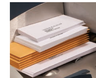
True mixed mail feeding allows varying types of mail to move through the system effortlessly.

High volume mailers demand speed and get it with the DP1100™. There is no other mailing system in its class that can get your big jobs done at the speeds the DP1100™ can handle. This system automatically feeds, seals, prints postage and stacks up to 295 pieces per minute of uniformly sized mail. You can rely on the advanced technology of the DP1100™ to help you get jobs out the door quickly.