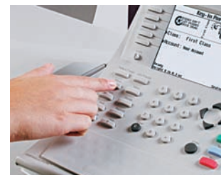
Step by step instructions are simple to use for any level operator.

Provides comfortable working height for maximum productivity, minimizes noise and vibration and has ample storage for supplies.